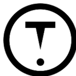
Class D2B Toxic Material Causing Other Toxic Effects