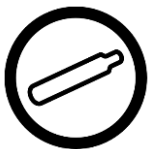
Class A Compressed Gases.